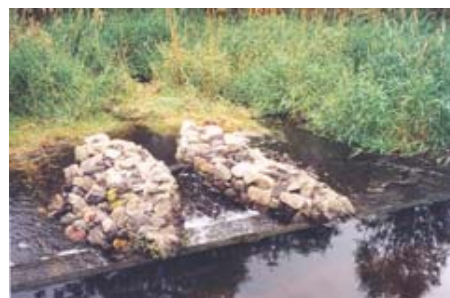
The new fish pass at Haddo