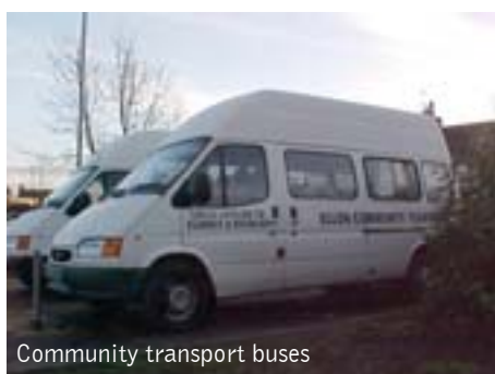
Community transport buses

The new 'association' of community transport has applied for and received £11,000 of funding to carry out an assessment of the local transport needs of communities in Formartine. We are grateful to the Rural Community Transport Initiative and Aberdeenshire Council for this support.