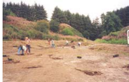
Planting up the wetland at Ythanwells

One river restoration site was selected before the project began due to requests from many local people. This site was at Gight Woods near Methlick, where one bank contained a Forestry Commission conifer tree plantation on the river's natural floodplain. As part of this project, Forestry Commission agreed to remove the conifers from the floodplain and allow the site to regrow as native broad-leaved woodland. To help it on its way, we'll be planting a few broad-leaved trees there during the winter of 2003/4. Future developments at this site will hopefully also include some new footpaths across the recently felled area.