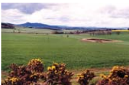
Across the fields of Formartine to Bennachie

Following the re-print of the Partnership's Tourism Group's leaflets, the group is now looking to develop new community-based tourism initiatives. During the early part of 2004, the Group will be holding a photographic competition , open to anyone with an interest in Formartine. The winning photos will feature an aspect of life in Formartine - a view, a building, an event past or present - and will form the basis of a series of post cards. The cards will be used to raise