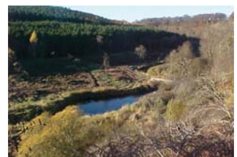
Gight floodplain after the felling