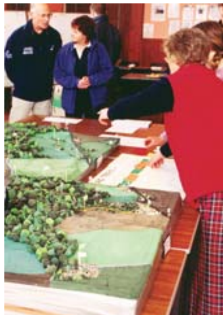
Planning for Real event at Windyhills

After the successful 'Planning for Real' events in Rothienorman (November 2002 - see March 2003 issue) and Woodhead & Windyhills (May 2003), the Aberdeenshire Community Planning Partnership* has awarded the Formartine Partnership grant assistance to support four further community participatory consultation events in our area. This is a great opportunity for communities to find out what their members really want to see happen locally. Consultation centres on a model of your area or village,