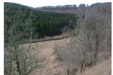
Gight floodplain before the felling