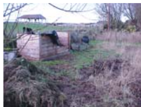
The planned community garden site

even produce flowers for the many planters and hanging baskets that are likely to appear in our towns and villages next summer.