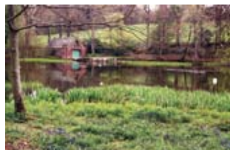
Fyvie castle grounds

The Tourism Group is currently developing a series of walking routes in Formartine, encouraging residents