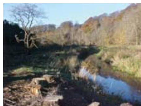
Newly cleared floodplain at Gight, near Methlick

The project works with farmers in two main ways. One is raising awareness of the grant schemes that farmers can use to create wildlife habitats on their farm and the second is through assisting farmers with nutrient budgets on their farms. Not all farmers were aware of the project and what it could do for them, so in the winter of 2002/3 we visited farms in the southern half of the catchment. By March 2003, 42 farmers had applied to the Scottish agri-environment scheme from the Ythan catchment, and once these farmers have created the wildlife habitats on their farms, over 38km of burns in the catchment will be protected with un-cropped strips of land next to them.