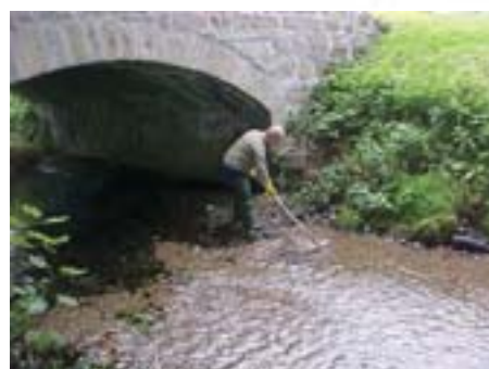
Finishing off the sea trout spawning bed near Tarves